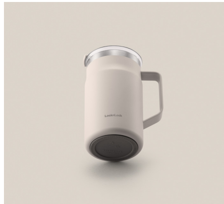
Silicone Silence Stopper