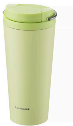
LHC3345 550ml SIZE 91x91.3x203.5mm CTN 8 PCS / 0.020 CBM