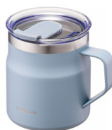
LHC4218 355ml SIZE 110x91x114mm CTN 8 PCS / 0.281