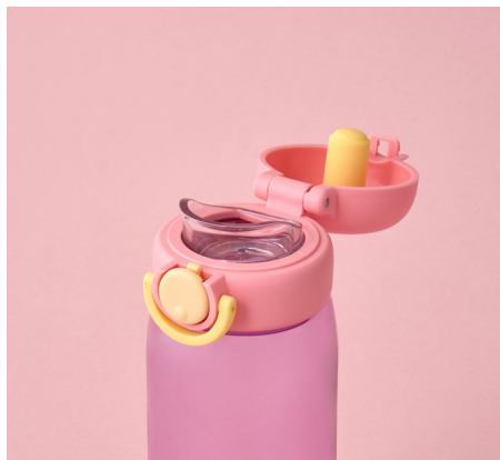
Baby-safe Tritan spout and body