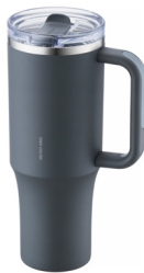
LHC4391 1.2L SIZE 99x99x217mm CTN 8 PCS / 0.048 CBM