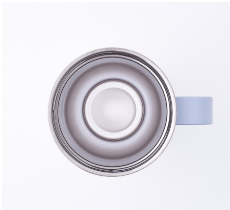
Stainless steel 304