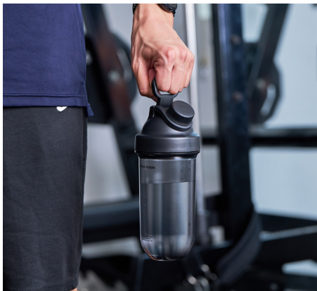
Mixes quietly and perfectly without a mixing ball