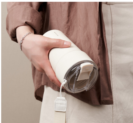
A secure Tritan material cap