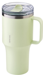
LHC4390 820ml SIZE 99x99x217mm CTN 8 PCS / 0.027 CBM