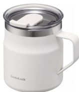
LHC4218 355ml SIZE 110x91x114mm CTN 8 PCS / 0.281