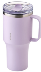
LHC4390 820ml SIZE 99x99x217mm CTN 8 PCS / 0.027 CBM