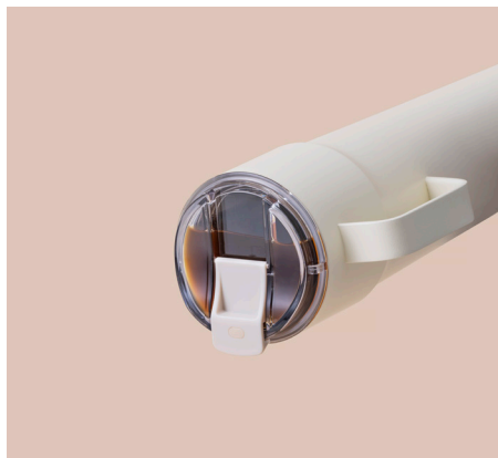
A secure Tritan material cap