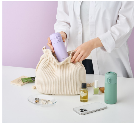
Portable and designed to easily fit anywhere