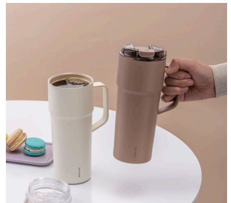
Ergonomically designed Handle