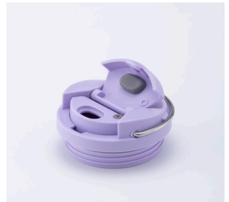
One-touch tab for easy one-handed opening