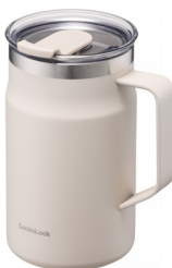
LHC4282 600ml SIZE 117x91x155mm CTN 8 PCS / 0.384 CBM