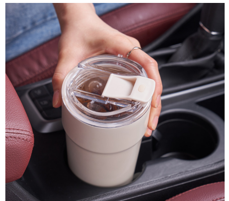
Compatible with car holders