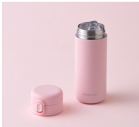
Double locking system for full sealing.