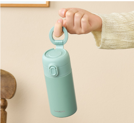
Can be carried by hooking it with a finger