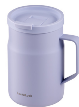
LHC4263 475ml SIZE 88x88x138mm CTN 8 PCS / 0.35 CBM