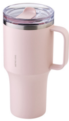
LHC4390 820ml SIZE 99x99x217mm CTN 8 PCS / 0.027 CBM