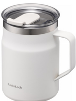
LHC4219 475ml SIZE 110x91x139mm CTN 8 PCS / 0.308