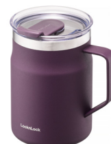
LHC4219 475ml SIZE 110x91x139mm CTN 8 PCS / 0.308