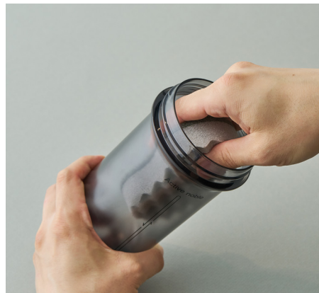
Easy to clean with a wide opening and smooth interior