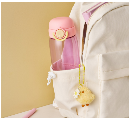
A water bottle in a size perfect for kids to carry