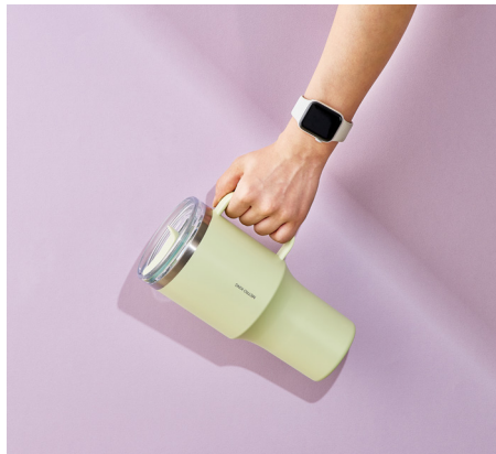
820ml Large Capacity Size