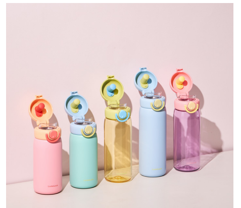
Customizable lid and body