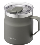
LHC4218 355ml SIZE 110x91x114mm CTN 8 PCS / 0.281