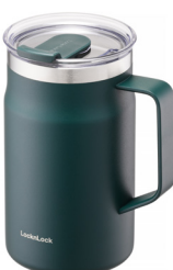
LHC4282 600ml SIZE 117x91x155mm CTN 8 PCS / 0.384 CBM