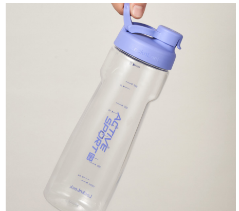
Convenient hidden finger loop for easy carrying