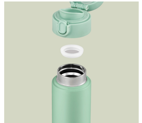
Locking mechanism for leak-proof portability