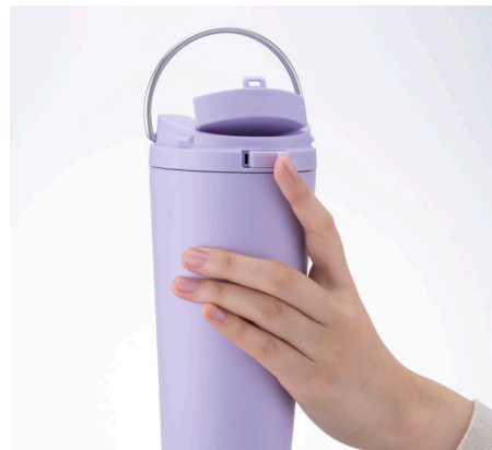
Comfortable grip that fits in one hand