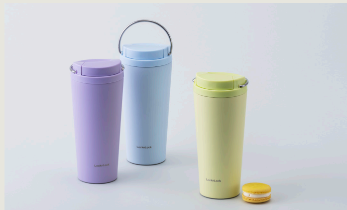
32 BUCKET LocknLock Tumbler