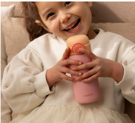
Durable 316L stainless steel, corrosion-resistant