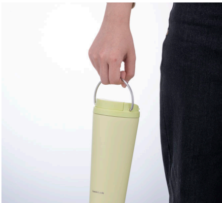
Convenient stainless steel handle for easy transport