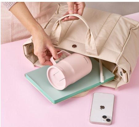
Airtight mug design