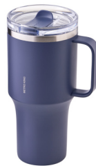
LHC4390 820ml SIZE 99x99x217mm CTN 8 PCS / 0.027 CBM