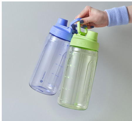
Convenient hidden finger loop for easy carrying