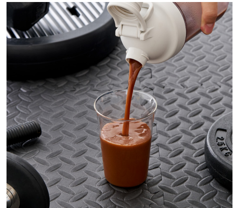
Made with Ecozen material for safe and worry-free use