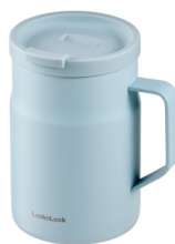
LHC4263 475ml SIZE 88x88x138mm CTN 8 PCS / 0.35 CBM