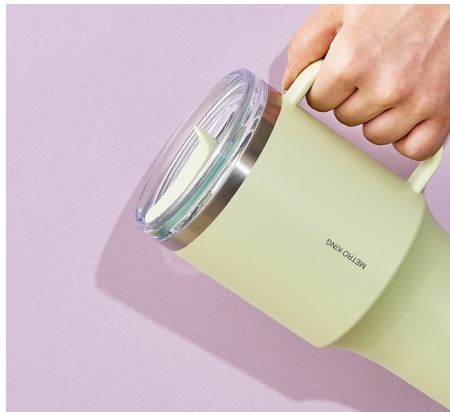
Comfortable PP handle grip