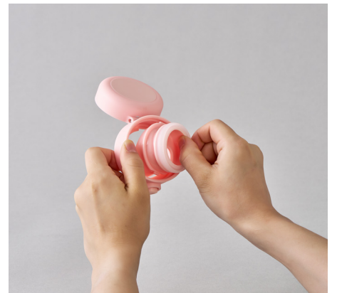
Wide opening for easy cleaning