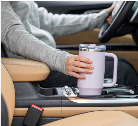
Compatible with car holders