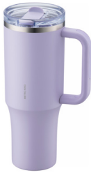
LHC4391 1.2L SIZE 99x99x265mm CTN 8 PCS / 0.048 CBM