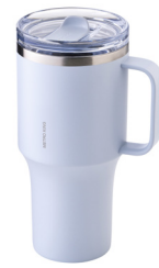
LHC4390 820ml SIZE 99x99x217mm CTN 8 PCS / 0.027 CBM