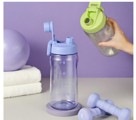
Excellent grip with the body's textured surface