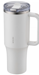
LHC4391 SIZE 99x99x217mm CTN 8 PCS / 0.048 CBM