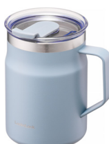
LHC4219 475ml SIZE 110x91x139mm CTN 8 PCS / 0.308