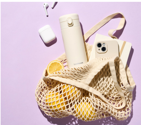
Easy one-touch tumbler, portable