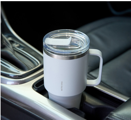
Compatible with car holders