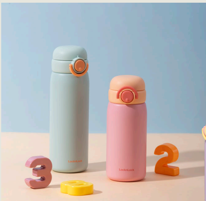
40 SCHOOL FIT LocknLock Tumbler & LocknLock Bottle