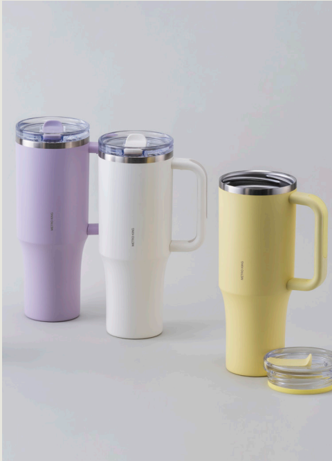
28 METRO KING LocknLock Tumbler