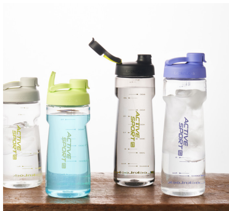
Made with Tritan material, a safe choice