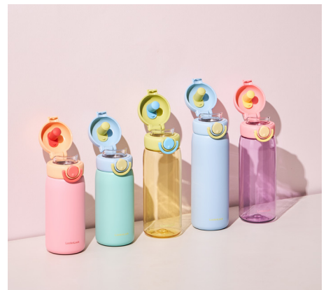
The locking ring prevents leaks and button presses