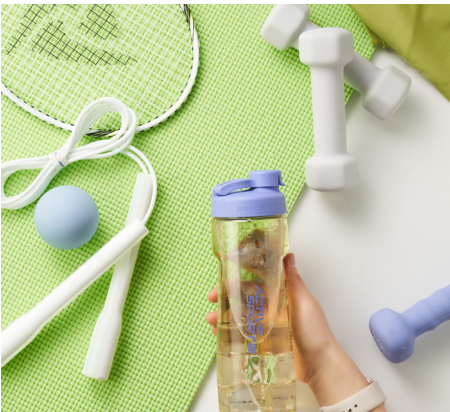
Hydration solution for workouts