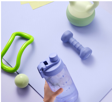
Hydration solution for workouts