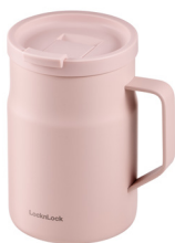
LHC4263 475ml SIZE 88x88x138mm CTN 8 PCS / 0.35 CBM