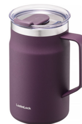
LD12904 600ml SIZE 117x91x155mm CTN 8 PCS / 0.384 CBM