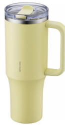
LHC4391 1.2L SIZE 99x99x217mm CTN 8 PCS / 0.048 CBM