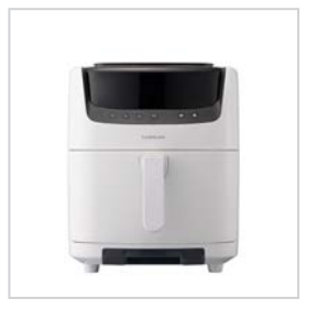
EJF881IVY 7 SIZE 324×400×394 mm CTN 1 PCS / 0.082 CBM