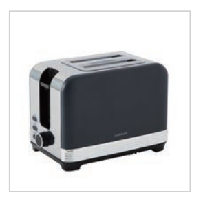
EJB226 GRY SIZE 265x175x188 mm CTN 6 PCS / 0.074 CBM

2 Slice toaster with modern design, the 7 heat level control dial. The dust cover and crumb tray make it more hygenic and easier to clean.