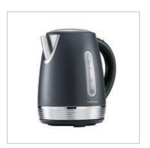
EJK726GRY 1.7L SIZE 225x162x217 mm CTN 8 PCS / 0.075 CBM

Large sized electric kettle with 1.7L body. Hygienic stainless inside makes it easy to clean.