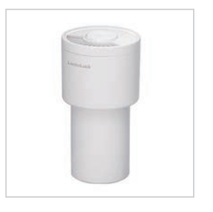
LHS002KEK WHT SIZE Ø85x160 mm CTN 12 PCS / 0.035 CBM

Easy one-button operation with consideration for the user has 3 modes (sleep mode, living mode, high speed mode) to suit your environment.