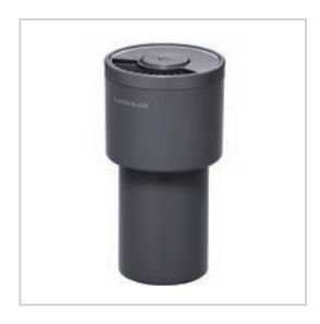
LHS002KEK DGRY SIZE Ø85x160 mm CTN 12 PCS / 0.035 CBM