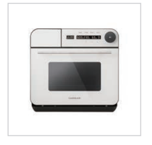
EJF896WHT 13QT / 2.5L

SIZE 392x475x390 mm CTN 1 PCS / 0.015 CBM