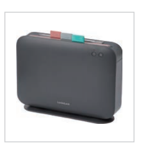
ENS116 DGRY SIZE 362x106x285 mm CTN 1 PCS / 0.033 CBM