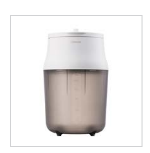
EJR781WHT 20kg SIZE ø324x93 mm CTN 8 PCS / 0.071 CBM