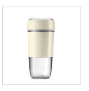
EJJ326IVY 350 ml SIZE ø85x190 mm CTN 8 PCS / 0.027 CBM

Favorite smoothies anywhere and anytime with the portable blender 20 cups of smoothies in single full charge.