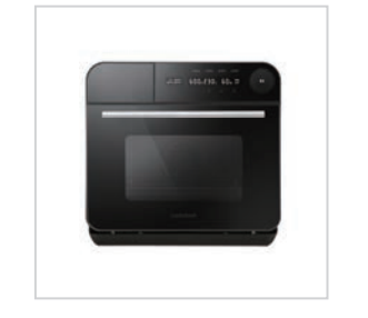
EJF896BLK 13QT / 2.5L

Add convenience and extend your cooking experience with LocknLock Steam Air Fryer. Experience smart cooking with delicious new recipes. Check out our website to download the app and search new recipes.