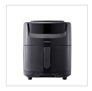
EJF881GRY 7 SIZE 324×400×394 mm CTN 1 PCS / 0.082 CBM