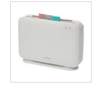
ENS116 WHT SIZE 362x106x285 mm CTN 1 PCS / 0.033 CBM